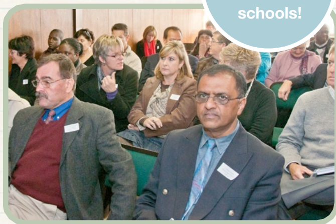
The room at full capacity at the 4th Principals Forum