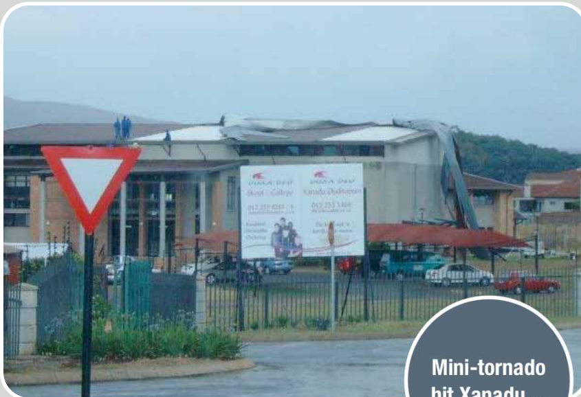
Mini-tornado hit Xanadu ...

prevent water damage to the chairs, coffee shop furniture, book shop and sound desk. While the carpeting has minor water damage, it is by the grace of God that no other serious damage was caused. The Xanadu team had to scramble on Friday to move most of their equipment back to the Schoemansville Auditorium for their Sunday services; they have since installed a temporary (and very securely fitted!!) roof while the insurance company assesses the damages.