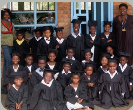
Almost completed facility – the official opening is on Friday the 13 th of May 2011