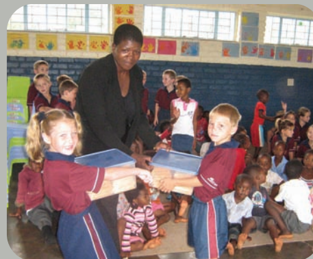
Xanadu learners deliver sandwiches and oats on a weekly basis