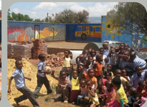
The project in December 2010